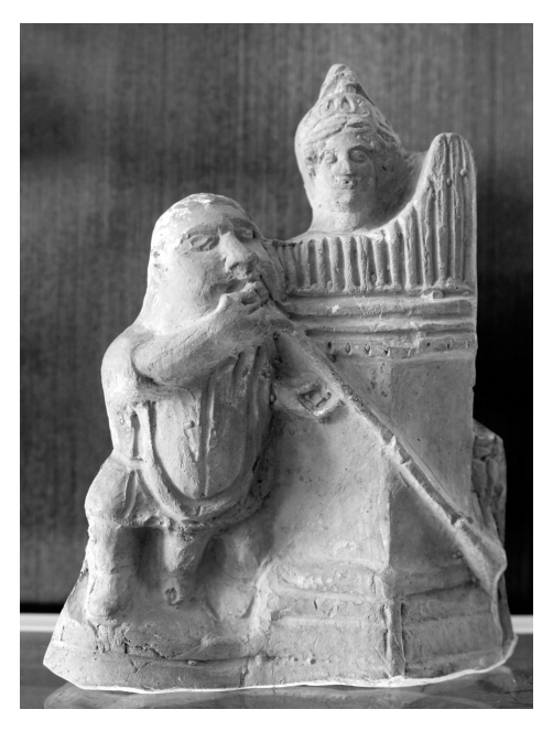
Figure 1. Musicians playing the hydraulis (water organ) and the salpinx. 1st century BCE, Alexandria. H. 13 cm. Gréau collection, 1891. Department of Greek, Etruscan, and Roman Antiquities, Louvre, CA 426. The hydraulis was invented in the 3<sup>rd</sup> c. BCE by Ctesibius, a predecessor of Heron at Alexandria; see Vitr. Arch. 10.7.

In some libation vases, after a five-drachm coin has been inserted, water streams out and flows around.