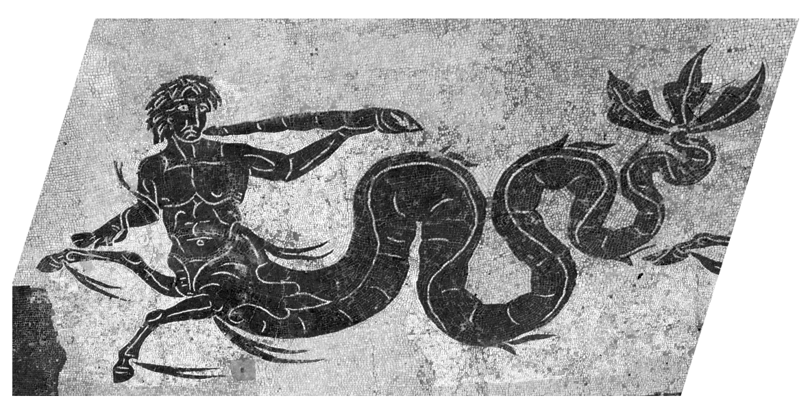
Figure 2. A Triton in the mosaic of Neptune (detail, with keystone correction), rm. 4, Regio II, Insula IV, Terme di Nettuno (II,IV,2) Ostia, Italy.

human actors on a theatrical stage needed to be raised, moved, and lowered sufficiently carefully to avoid injury and conduct a play. A rope mounted over pulleys and attached to a counterweight would have been sufficient for the Triton. Once the automaton had been raised, the counterweight could be freed to enable Triton to sink of his own accord.